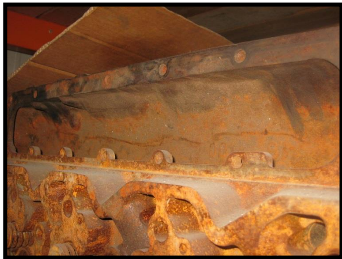
Above & Below: 5.9L 24V COMMON RAIL, ISBE, 2003-07. Inside the intake is smooth inside and from the back side the intake is a smooth transition.