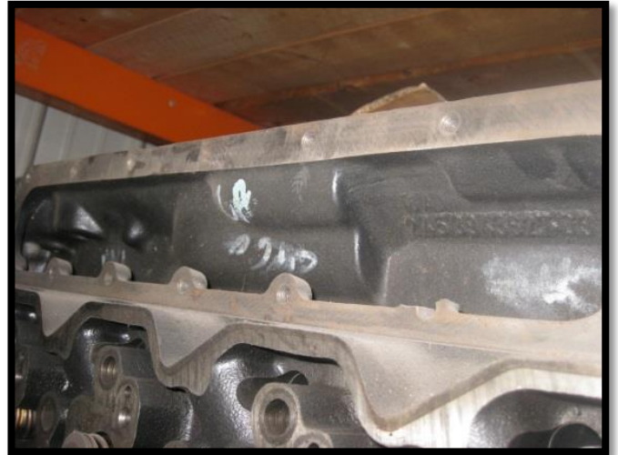
Above & Below: 5.9L, 24V, ISB, 1998.5-2002. Intake has big "lump" in the center and back side has more of a sharp edge transition.